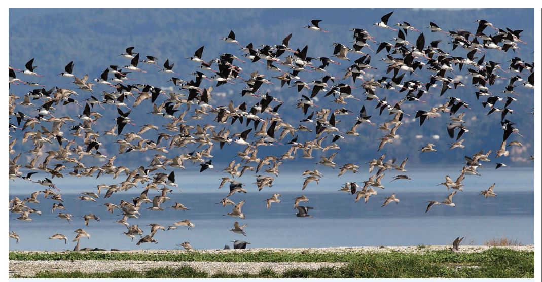
Pied stilts and bar-tailed godwits take flight from one of the shell-bank roosting areas along the Watercare Coastal Walkway.